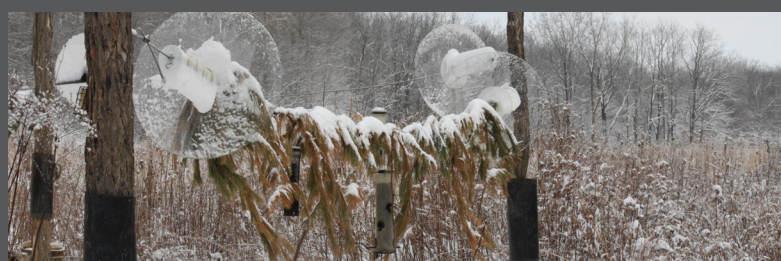
Deer Haven Park

Watch for special events, programs, displays, and more. Beginning spring, 2017.