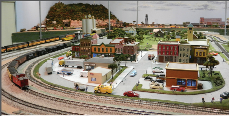
Model Train Layout, Trailhouse at Sandel Legacy Trail