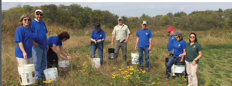
Volunteers & Staff gathering prairie plant seeds