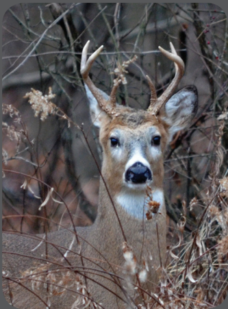
White-Tailed Deer Fritz Guth