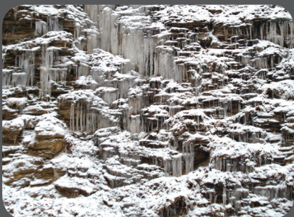
Frozen Shale Wall at Shale Hollow Park

The artistry of winter speaks to us, even as the winds howl and the snow swirls.