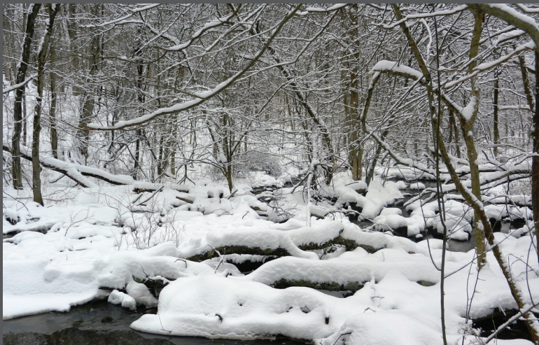
Deer Haven Park